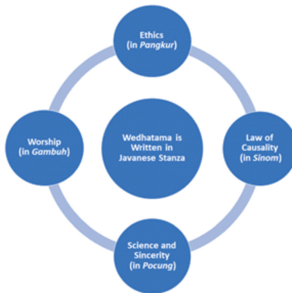
Figure 1. Etymologically, Wedhatama is originated from the words wedha and tama . Wedha means knowledge and tama means main goodness. It contains 5 basic principles about the existence of God, human relationship, knight soul ( jiwa ksatria ), respect for other, and struggle of life teachings. The manuscript is written in the form of Javanese stanza (Javanese poetic rhythm), which is divided into 4 forms of stanza: namely Pangkur (7 lines), Sinom (9 lines), Pocung (4 lines), and Gambuh (5 lines).

Sembah Jiwa (soul worship), as a third worship written in the manuscript, aims to understand identity as a human being. Sembah Jiwa is truly dedicated toward