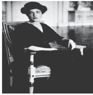
Figure 2: Photograph of Adele Bloch-Bauer, 1907