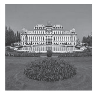
Figure 3: Belvedere Palace, Vienna