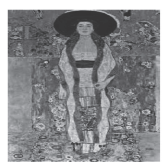
Figure 6: Gustav Klimt, Portrait of Adele Block-Bauer, 1912