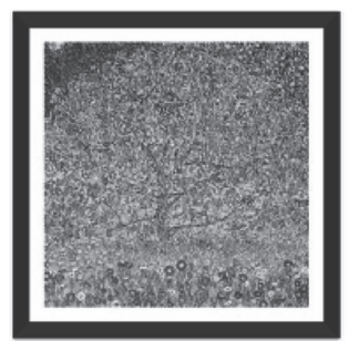
Figure 8: Klimt, Apple Tree, 1912