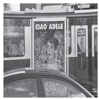
Figure 15: Poster CIAO ADELE in street car, Vienna, 2006