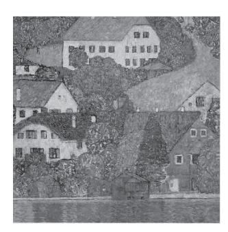
Figure 7: Gustav Klimt, Houses above the Altersee, 1916