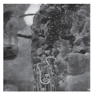
Figure 11: Klimt, Pain (part of Medicine panels) designed for U of Vienna ceiling