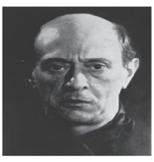
Figure 5: Arnold Schoenberg painted by Man Ray, 1927