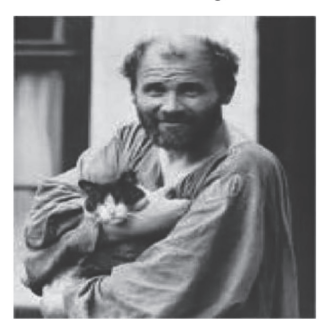
Figure 14: Gustav Klimt in his painter's smock, c. 1905