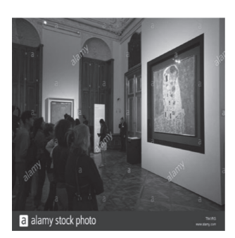
Figure 4: Klimt Gallery, Belvedere Palace, c. 2,000