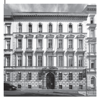
Figure 10: Palais Bloch Bauer, 18 Elisabeth Strasse, c. 1910