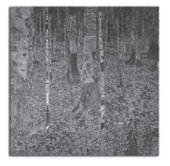
Figure 9: Klimt, Buchenwald, 1912