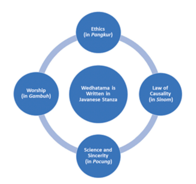
Figure 1. Etymologically, Wedhatama is originated from the words wedha and tama . Wedha means knowledge and tama means main goodness. It contains 5 basic principles about the existence of God, human relationship, knight soul (jiwa ksatria), respect for other, and struggle of life teachings. The manuscript is written in the form of Javanese stanza (Javanese poetic rhythm), which is divided into 4 forms of stanza: namely Pangkur (7 lines), Sinom (9 lines), Pocung (4 lines), and Gambuh (5 lines).

Sembah Jiwa (soul worship), as a third worship written in the manuscript, aims to understand identity as a human being. Sembah Jiwa is truly dedicated toward