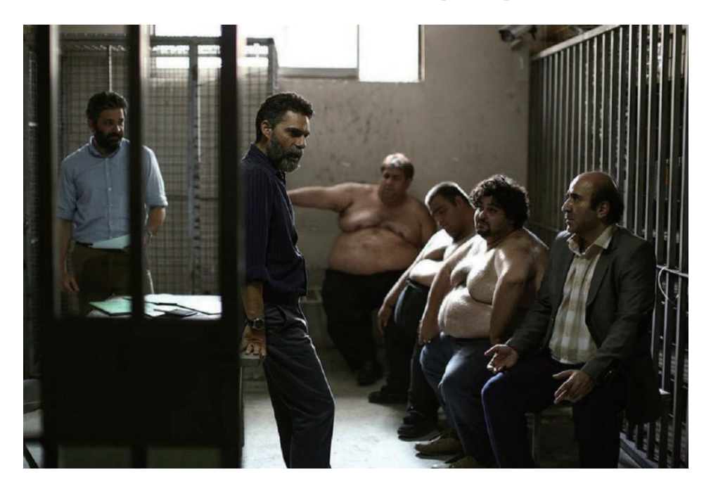
Figure 2. Several large obese men as drug mules are employed to use their big stomachs as containers of illegal drugs, Screen shot.